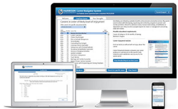
Online Interactive Career Portal